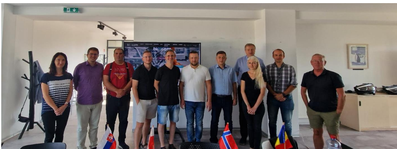
TPM participants at the BIZZCOM Company, Bucany, Slovakia

The activities and events of the project were mentioned, as well as the result that should be achieved at the end of the project.